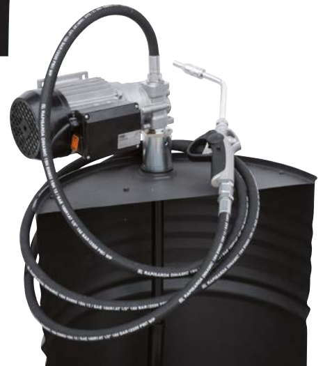
VISCOMAT GEAR DRUM AC