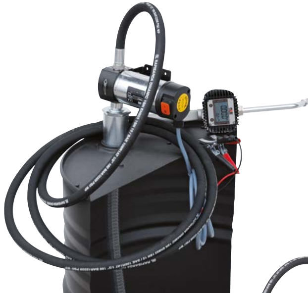
VISCOMAT GEAR DRUM DC