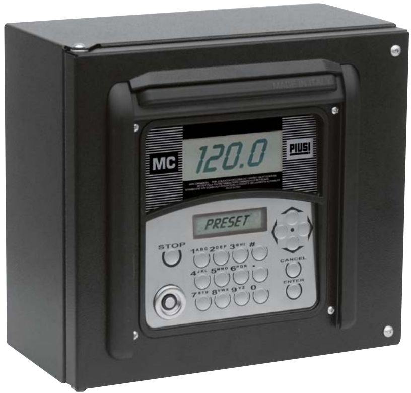
MC BOX 2.0